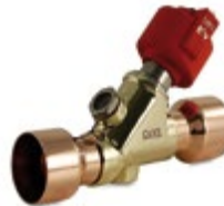
The electronic expansion valve allows an improvement of performance.