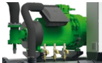
High efficiency screw compressors designed for R513A refrigerant gas.