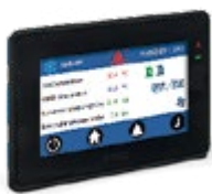
Latest-generation touch screen user terminal.